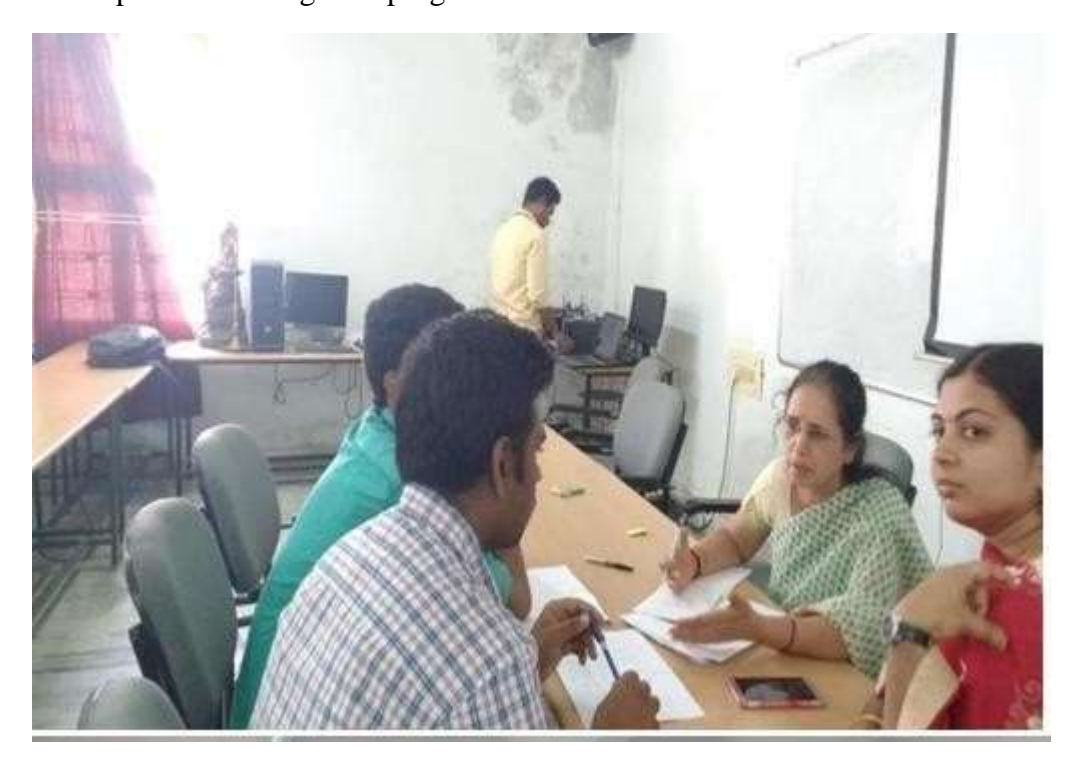
Orientation Program for Entrepreneurship on 22-09-18

Several faculty and students actively participated and gained knowledge and hands on experience through the program